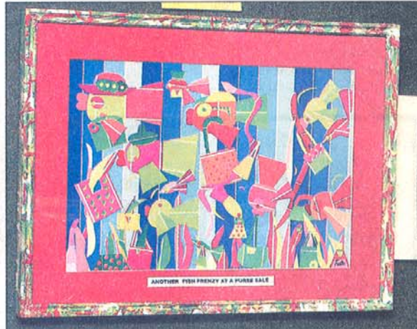
Another Fish Frenzy at a Purse Sale