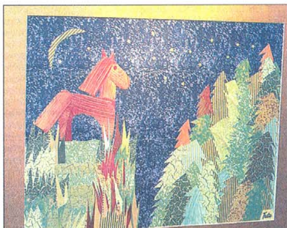
Horse On A Hill